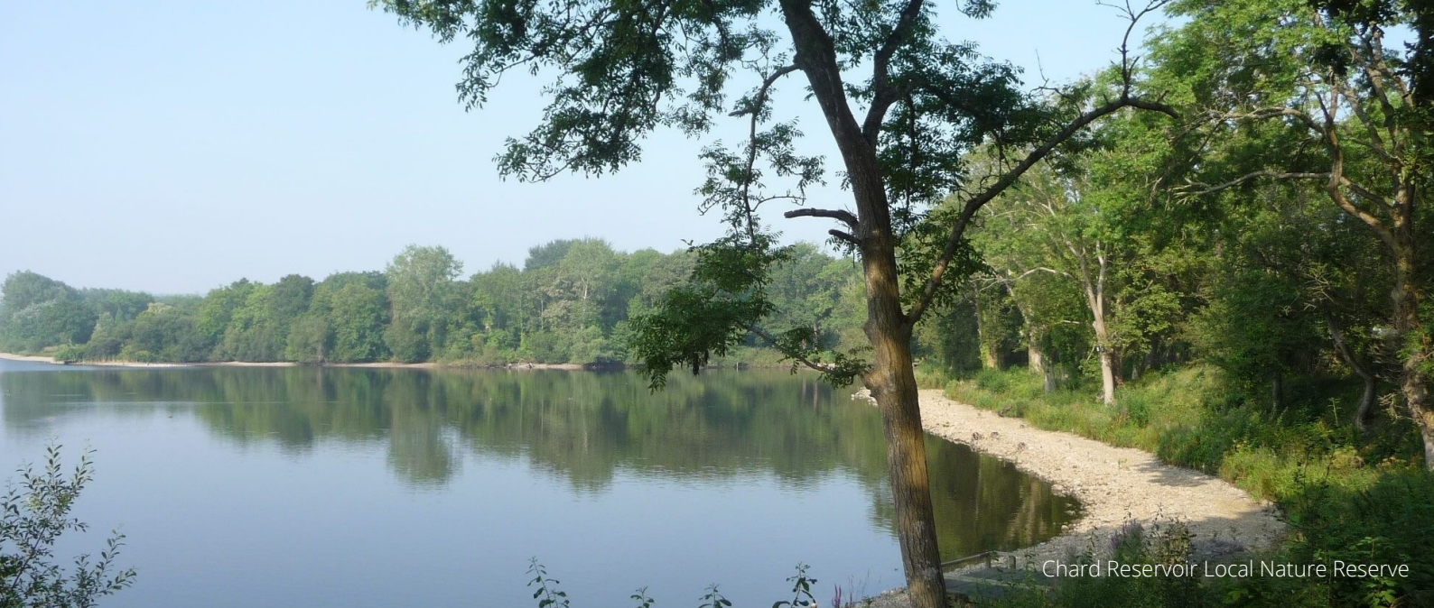
Chard Reservoir Local Nature Reserve